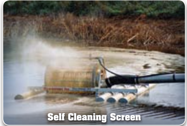
Self Cleaning Screen