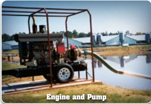
Engine and Pump

If nutrient water management is important to you, contact us. We can help you convert livestock wastewater expense into a valuable asset through efficient crop fertilization delivered where and when it is needed either above or below the crop canopy for minimal drift and odor control. Let us help turn your nutrient water management challenges into business advantages.