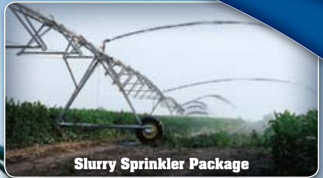
Slurry Sprinkler Package