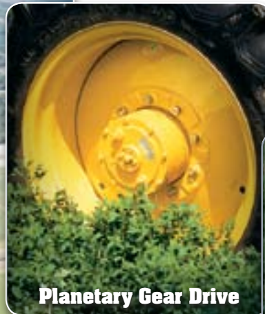
Planetary Gear Drive