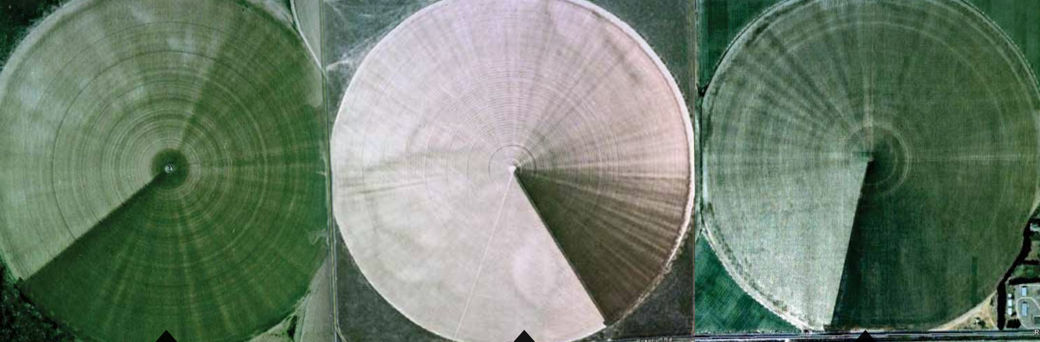
Electric Pivot Systems