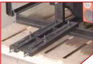
▶ Side Generator Mount