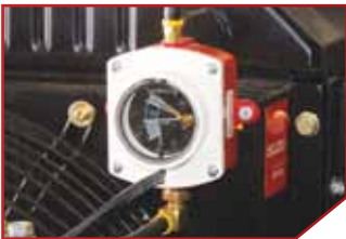
▶ L150 Sight Water Level Gauge