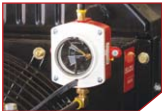
▶ L150 Sight Water Level Gauge