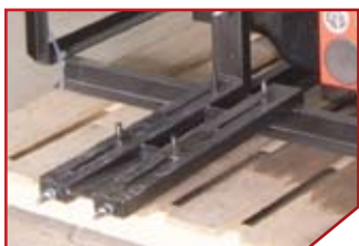
▶ Side Generator Mount